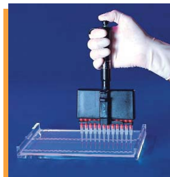
Multichannel Pipette Compatible (8 or 12 Channel)