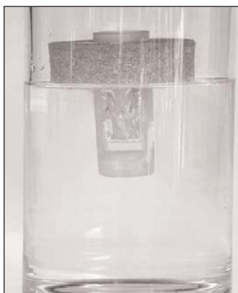
Figure 1: Dialysis with MEGA FlexTube

IMPORTANT: To perform dialysis with a range of 3 - 10ml use IBI MEGA 10ml FlexTubes. To perform dialysis with a range of 10 - 15ml use IBI MEGA 15ml FlexTubes. To perform dialysis with a range of 15 - 20ml use IBI MEGA 20ml FlexTubes.