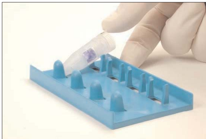
Figure 3: Insertion of the IBI FlexTube in the provided supporting tray. The arrow on the cap should be pointing upwards.

IMPORTANT: The two membranes of the IBI Flextube(s) must be in perpendicular to the electric field to permit the electric current to pass through the tube.