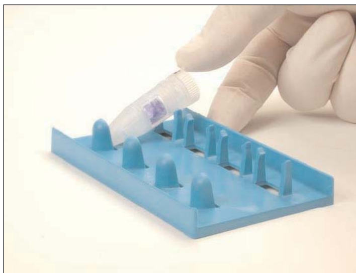
Figure 1: Insertion of the IBI FlexTube in the provided supporting tray. The arrow on the cap should be pointing upwards.

IMPORTANT: The arrow on the cap should be pointing face up. The two membranes of the IBI FlexTube must be in perpendicular to the electric field to permit the electric current to pass through the tube.