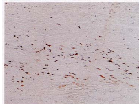
Immunohistochemical staining of the early stage of human atherosclerotic lesions of the aorta with anti-AGEs antibody 6D12.

Clinical nephrology , Vol.42, 354-361, 1994